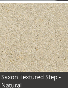
Saxon Textured Step - Natural