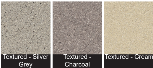
Textured - Silver Grey