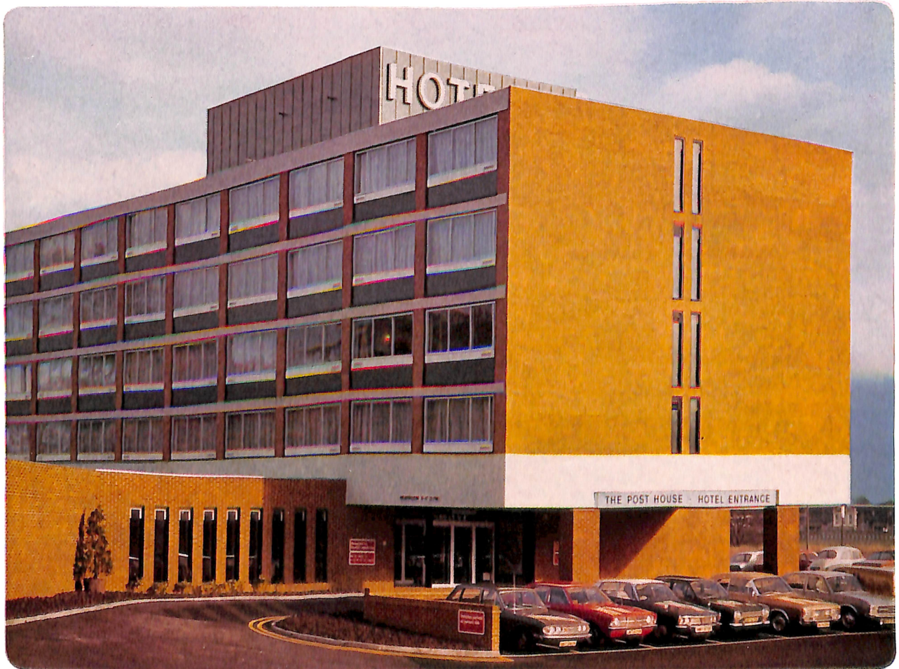
The Post House York, for Trust Houses Forte Limited