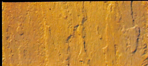
YORK BROWN Ref YB