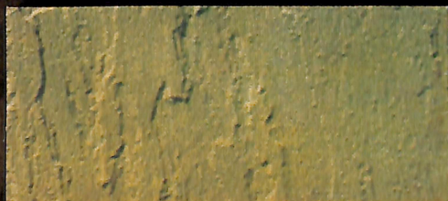
LIGHT GREEN Ref LG