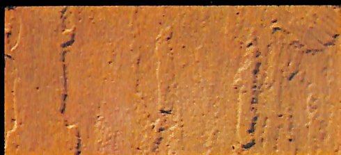
BRICK RED Ref BR