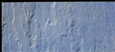
SEA BLUE Ref SB