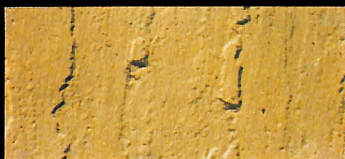
LIGHT BUFF Ref LB