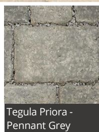
Tegula Priora - Pennant Grey

*Natural products are manufactured from aggregates sourced locally to the works and contain no pigmentation, therefore colour variation between products from different works is possible.