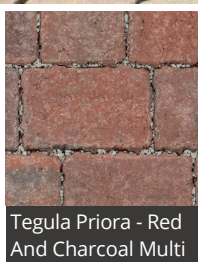
Tegula Priora - Red And Charcoal Multi