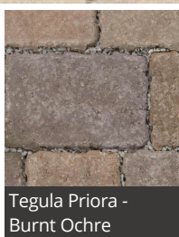
Tegula Priora - Burnt Ochre