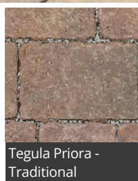
Tegula Priora - Traditional