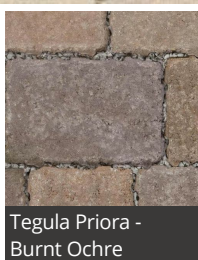
Tegula Priora - Burnt Ochre