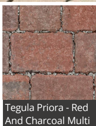
Tegula Priora - Red And Charcoal Multi