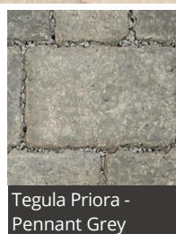
Tegula Priora - Pennant Grey

*Natural products are manufactured from aggregates sourced locally to the works and contain no pigmentation, therefore colour variation between products from different works is possible.