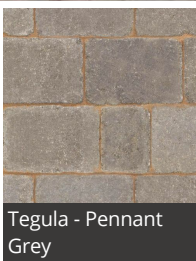
Tegula - Pennant Grey

*Natural products are manufactured from aggregates sourced locally to the works and contain no pigmentation, therefore colour variation between products from different works is possible.