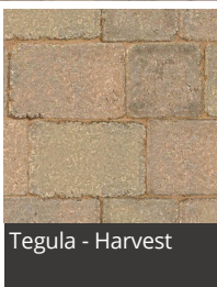
Tegula - Harvest