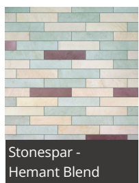
Stonespar - Hemant Blend

*It should be noted that colour variations and markings are characteristic of Natural Stone. Inherent variations cannot be controlled nor the precise shade of stone guaranteed.