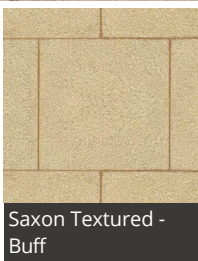
Saxon Textured - Buff