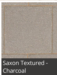
Saxon Textured - Charcoal

Marshall's Saxon Textured Flag Paving is designed to provide a unique surface finish through its blend of a hard Yorkstone aggregate. The manufacture of the paving stones, in which Saxon Paving is given its textured finish, means that it delivers both durability and non-slip properties.