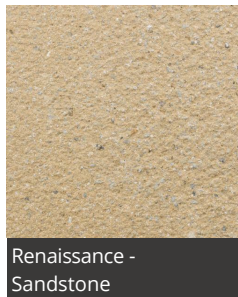
Renaissance - Sandstone