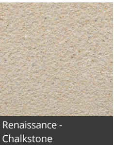
Renaissance - Chalkstone