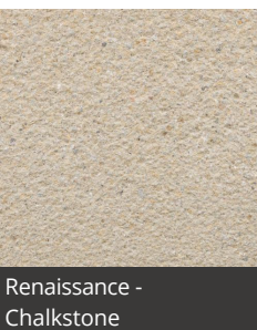
Renaissance - Chalkstone