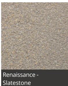
Renaissance - Slatestone

Designed to help promote long-term economic and environmental benefits, Renaissance Paving is a lightly textured paving solution created using 80% recycled content and non-virgin aggregates.