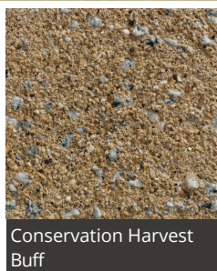
Conservation Harvest Buff