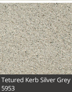
Tetured Kerb Silver Grey 5953