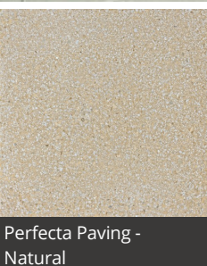
Perfecta Paving - Natural