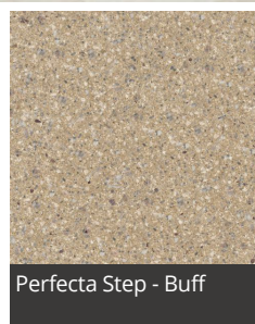
Perfecta Step - Buff

Blended with a hard Yorkstone aggregate, Marshall's Perfecta Smooth Ground Flag Paving combines fantastic aesthetics and outstanding technical performance to act as a cost-effective alternative to premium natural Yorkstone.