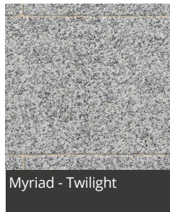
Myriad - Twilight