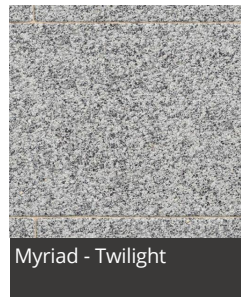
Myriad - Twilight