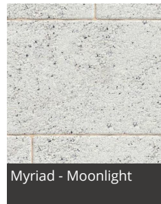
Myriad - Moonlight

*Natural products are manufactured from aggregates sourced locally to the works and contain no pigmentation, therefore colour variation between products from different works is possible.