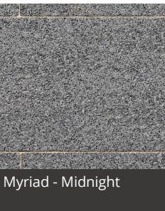
Myriad - Midnight