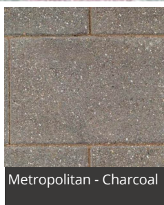
Metropolitan - Charcoal

*Natural products are manufactured from aggregates sourced locally to the works and contain no pigmentation, therefore colour variation between products from different works is possible.