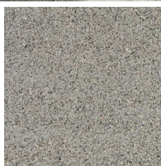
La Linia Priora - Grey Granite