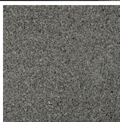
La Linia Priora - Anthracite Basalt