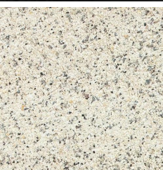
La Linia Priora - Light Granite