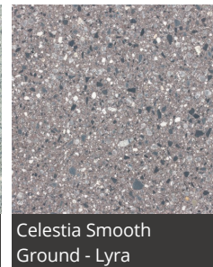
Celestia Smooth Ground - Lyra

For contemporary design and visual impact, Marshall's Celestia paving is a high-performance, high-quality product that can complement any modern development.