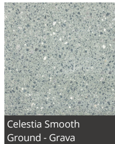
Celestia Smooth Ground - Grava