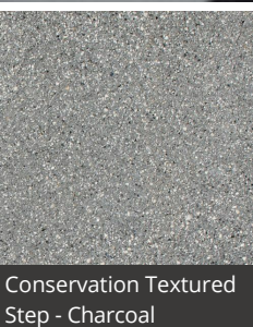
Conservation Textured Step - Charcoal