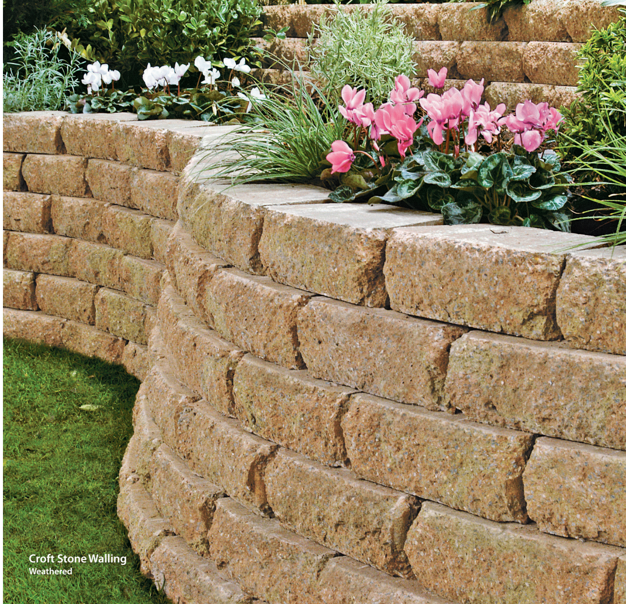
Croft Stone Walling Weathered