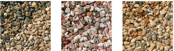
Sea-Washed 10mm Multi Flint Spar 8-11mm Golden Blend 10mm