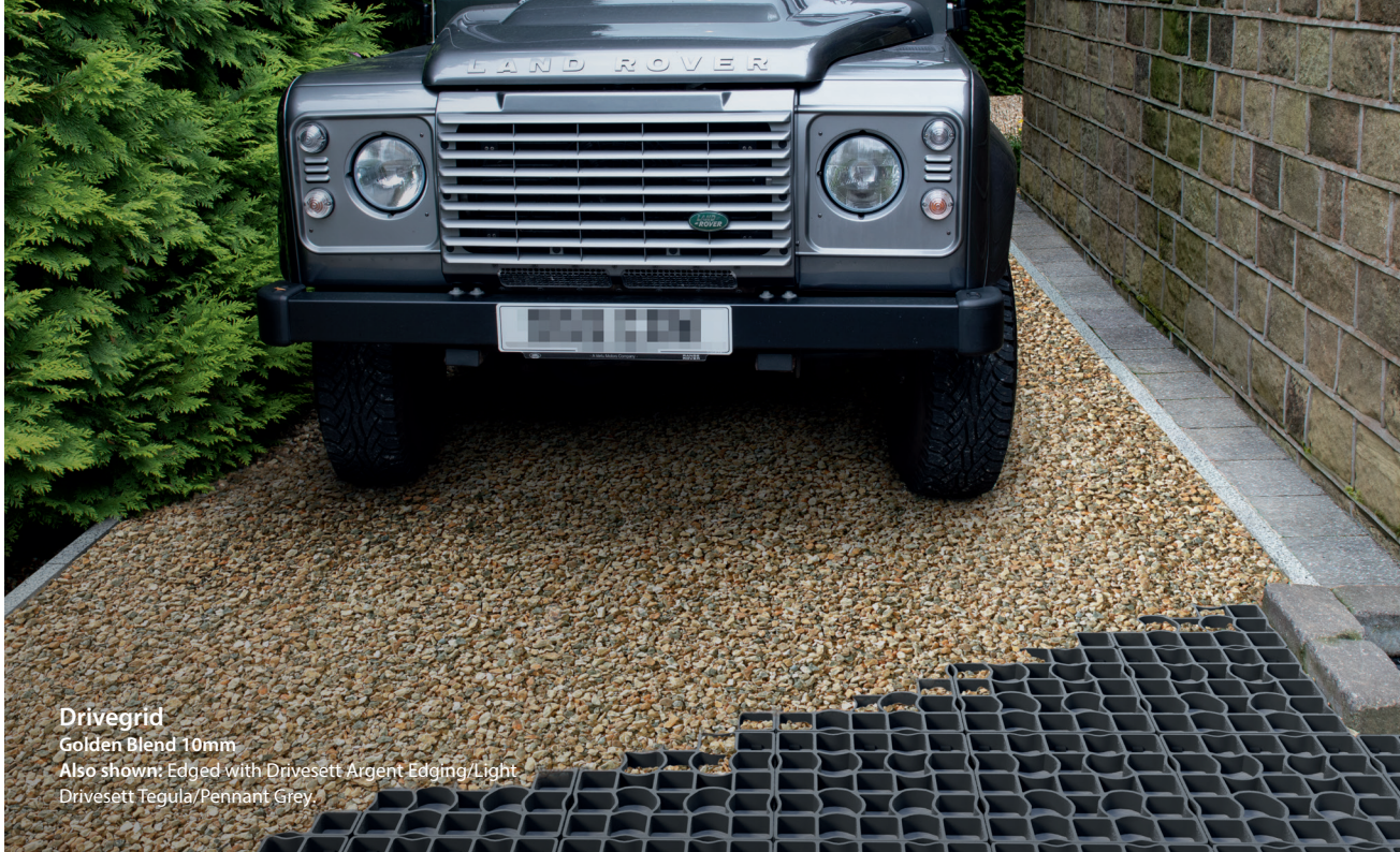
Drivegrid Golden Blend 10mm Also shown: Edged with Drivesett Argent Edging/Light Drivesett Tegula/Pennant Grey