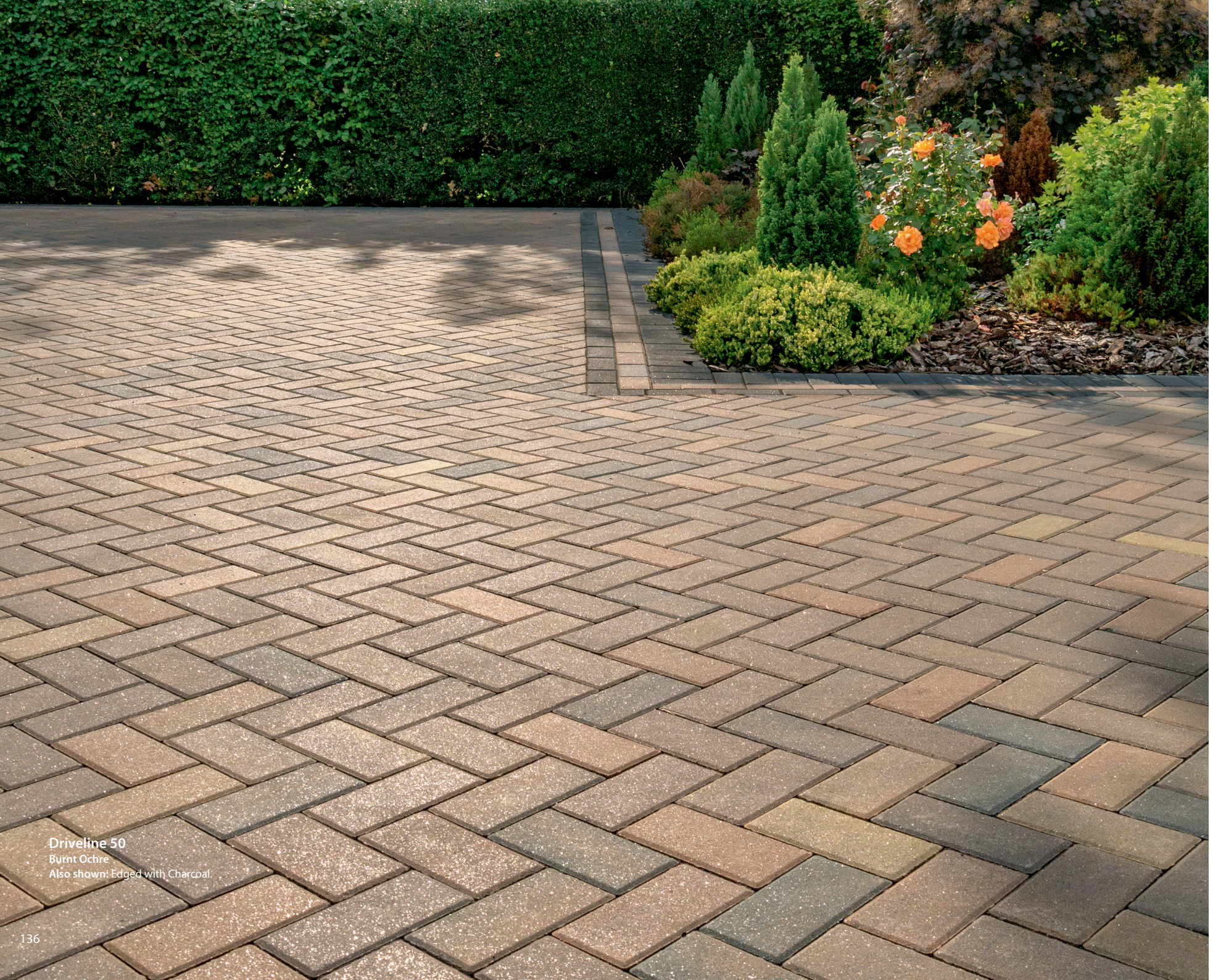
Driveline 50 Bürnt Ochre Also shown: Edged with Charcoal.