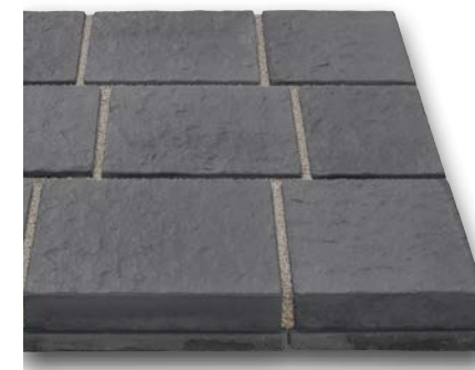
Blue Pennant (BP)