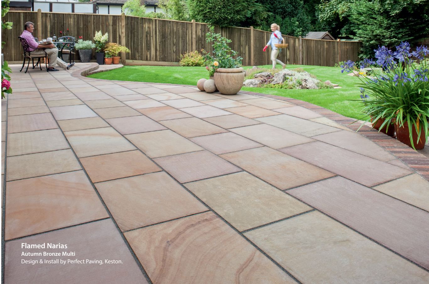
Flamed Narias Autumn Bronze Multi Design & Install by Perfect Paving, Keston.