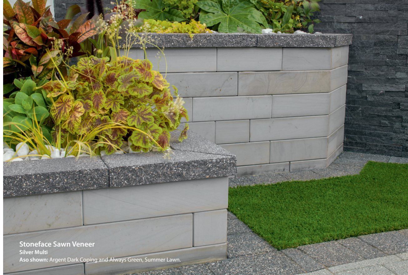
Stoneface Sawn Veneer