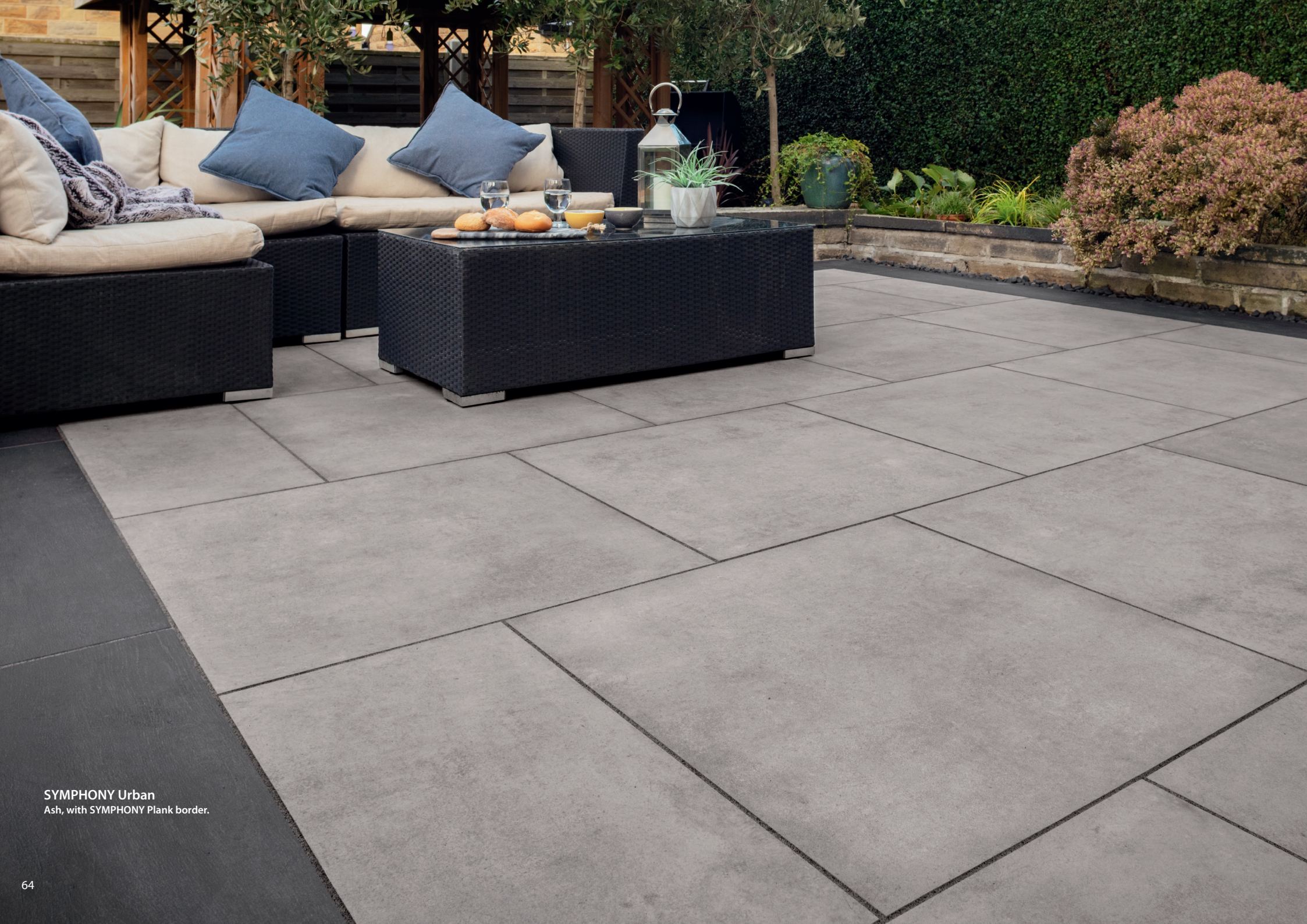
SYMPHONY Urban Ash, with SYMPHONY Plank border.