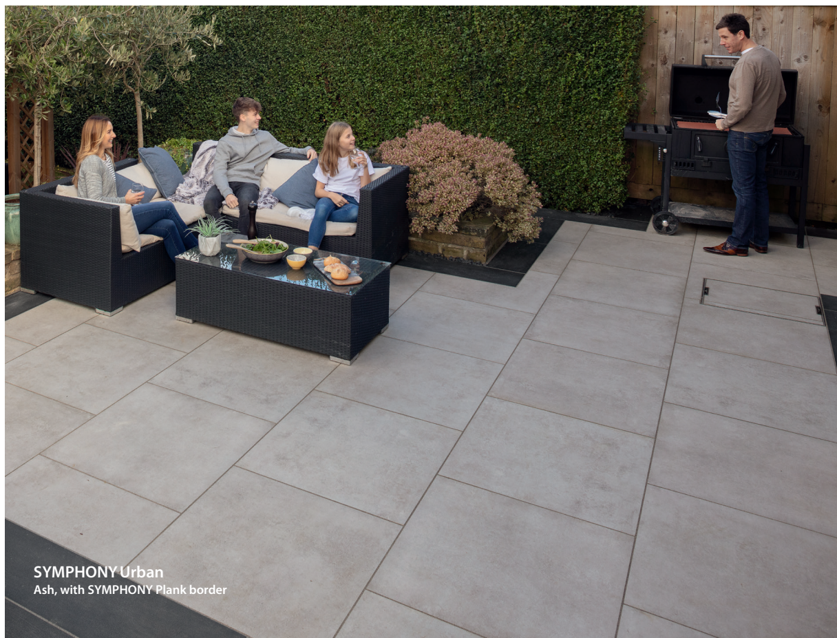
SYMPHONY Urban Ash, with SYMPHONY Plank border