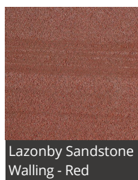
Lazonby Sandstone Walling - Red

Lazonby block comes from one of Marshalls' portfolio of British stone quarries. This stone is available in block form; perfect for usage by companies that add value to natural stone.