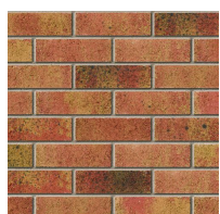
Peakdale Shearsby Burnt Flame Facing Brick Swatch Panel

Fiery red complemented with warm orange and hints of black flecking give this concrete facing brick a certain warmth, whilst providing a crisp clean look when in-situ. Buildings faced in Shearsby Burnt Flame provide a gentle and inviting aesthetic.