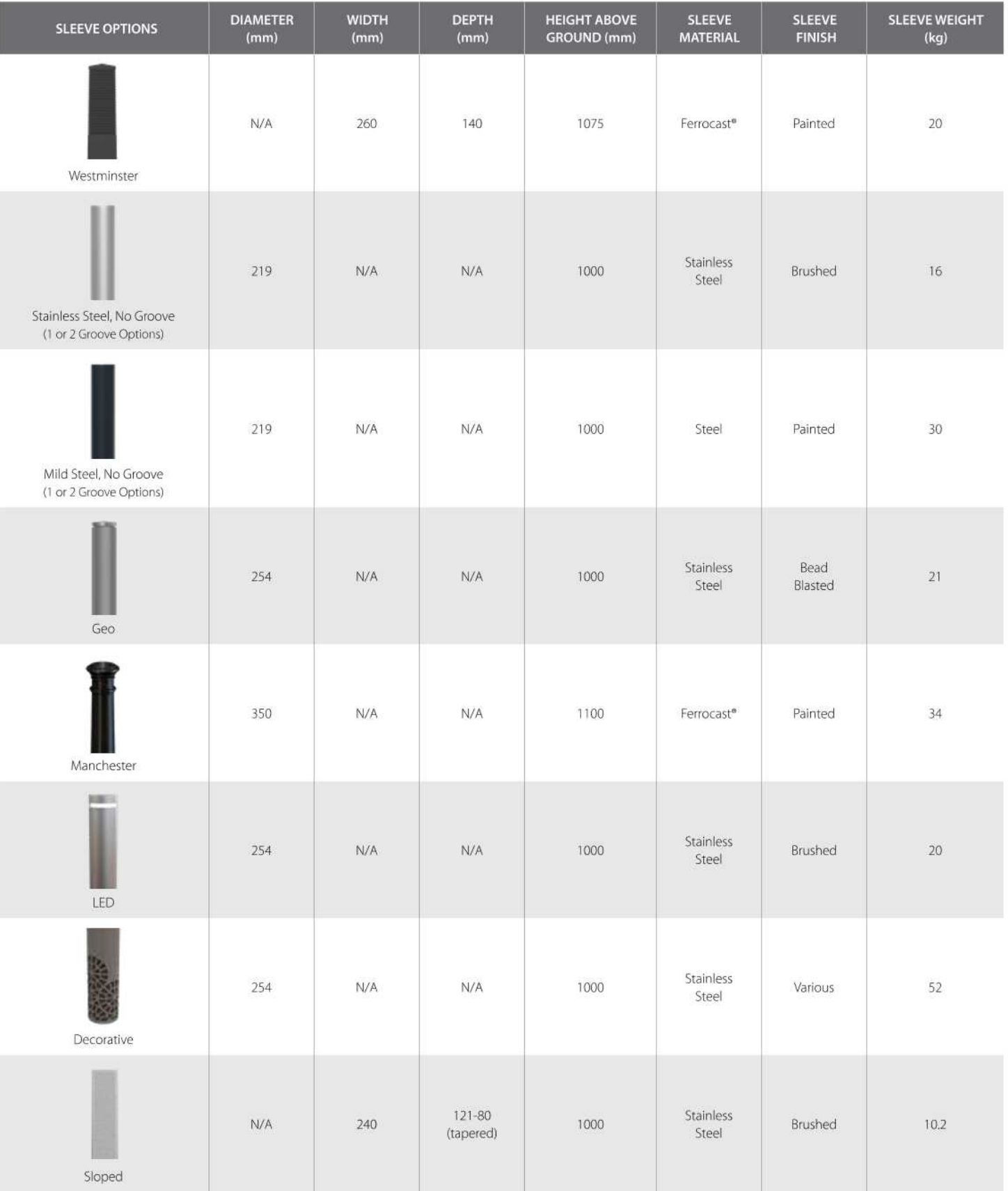
Standard Sleeve Specifications