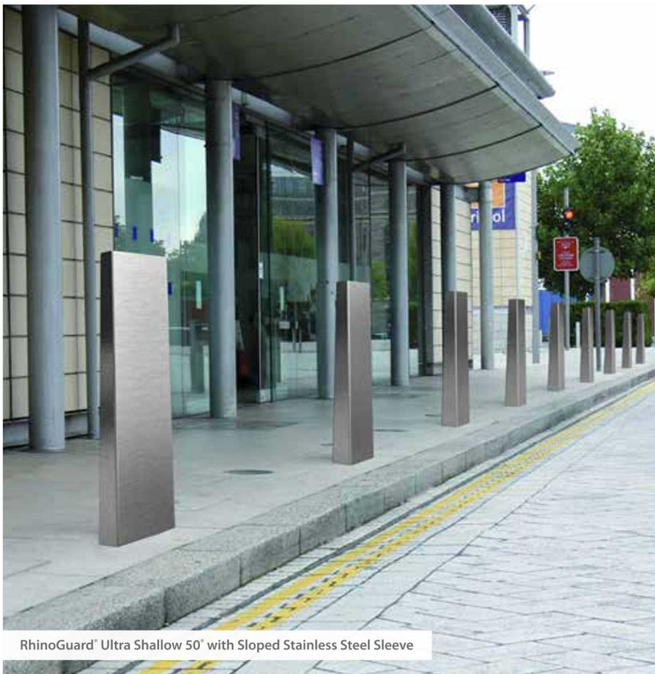
RhinoGuard® Ultra Shallow 50° with Sloped Stainless Steel Sleeve