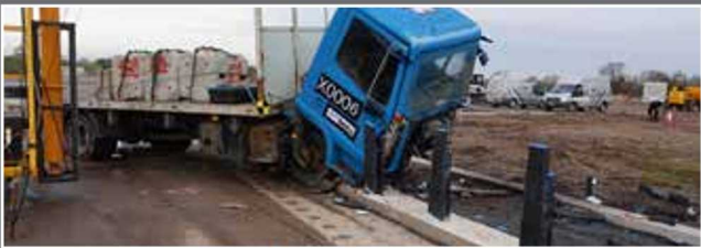
IWA-14.1:2013 Bollard, Cycle Segregation Performance Rating: V/7200(N2A)/48/30:1.1

Both tests demonstrate a real life scenario by impacting a single bollard at 30 degrees which is considered to be the most likely angle of attack on long linear runs of perimeter protection.