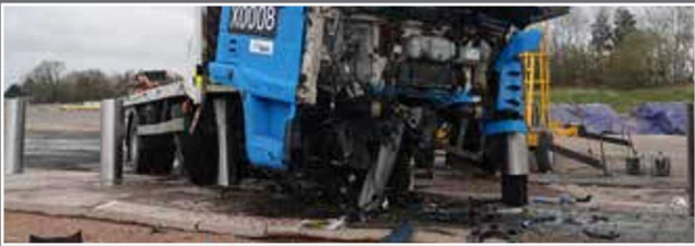
IWA-14.1:2013 Bollard, Footpath Installation Performance Rating: V/7200(N2A)/48/30:1.1