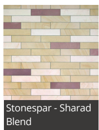
Stonespar - Sharad Blend

*It should be noted that colour variations and markings are characteristic of Natural Stone. Inherent variations cannot be controlled nor the precise shade of stone guaranteed.