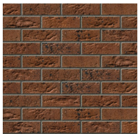
Kingsvale Payton Heath

Not only does this brick offer beautiful warm brown orange tones, it further benefits from a subtle flecking and creased texture to the face. This facing brick is part of the innovative Kingsvale range. A stunning range of sustainable facing bricks products brought to you by Marshalls Bricks and Masonry.